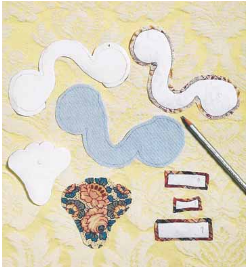
Photograph 2. Freezer paper technique.

Then for stitch-free basting, remove the paper, place it behind the shape with the shiny side up and fuse the seam allowance only to the edge of the paper with the point of the iron. Stitch it invisibly in place and remove the freezer paper as for the paper-patch method.