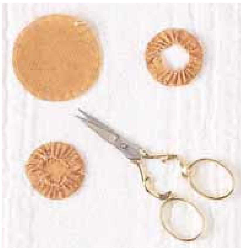
Photograph 3. How to achieve a perfect circle.