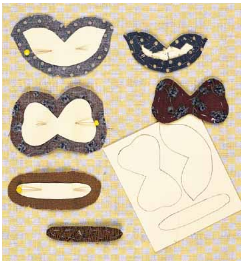
Photograph 1. Paper-patch technique.

Adapt the paper-patch method by fusing the paper shape lightly to the front of the selected fabric and cutting it out with a seam allowance, refer to photograph 2.